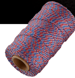
RBL100UK Red, White & Blue - 100m