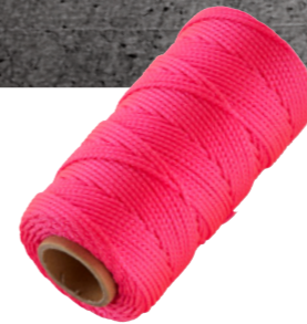
BL76 Hi Vis Pink - 76m