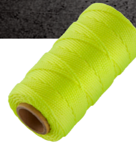
BL76Y Hi Vis Yellow - 76m