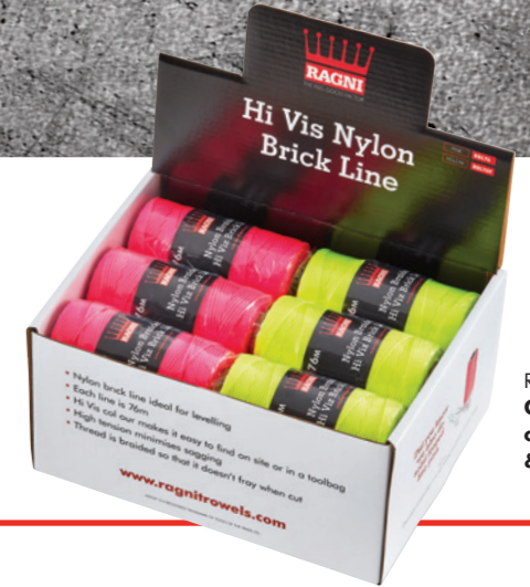
RBL12 Countertop box of 12 Hi Vis Pink & Yellow lines