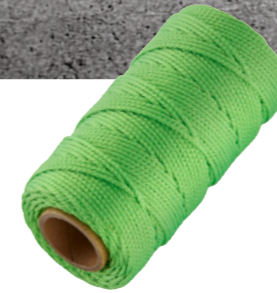
BL76G Hi Vis Green - 76m