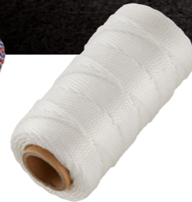
RBL76W White - 76m